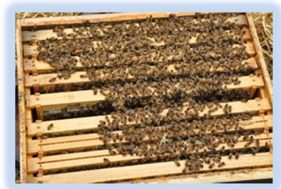
ACTIVE BEE YARD Veil Only; Please - No Gloves